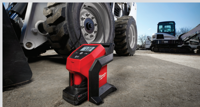
INFLATES CAR, LIGHT TRUCK & COMPACT EQUIPMENT TIRES

LESS DOWNTIME: TOP OFF A CAR TIRE IN UNDER 1 MINUTE